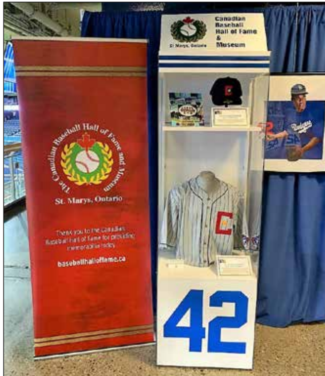
The Canadian Baseball Hall of Fame commemorated the 75th anniversary of Jackie Robinson's Major League debut with an artifacts display at Rogers Centre last Friday.

Robinson's tenure in Montreal is part of a long and rich history of Black players and teams in Canada