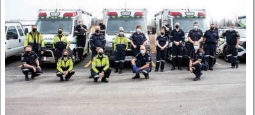
Niagara EMS crew, the Fall, Fall/Winter, Team and Mental Health and Addiction Response Team at their headquarters in Oriskany, Niagara on the Lake. ©2021/05/12