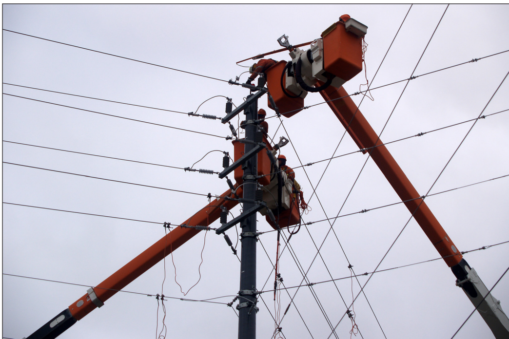
Hydro One crews were working across from the Temiskaming Hospital on Shepherdson Road southward to North Cobalt and outside of Cobalt and in other off-road areas making improvements to two circuit lines Sunday afternoon, May 15.