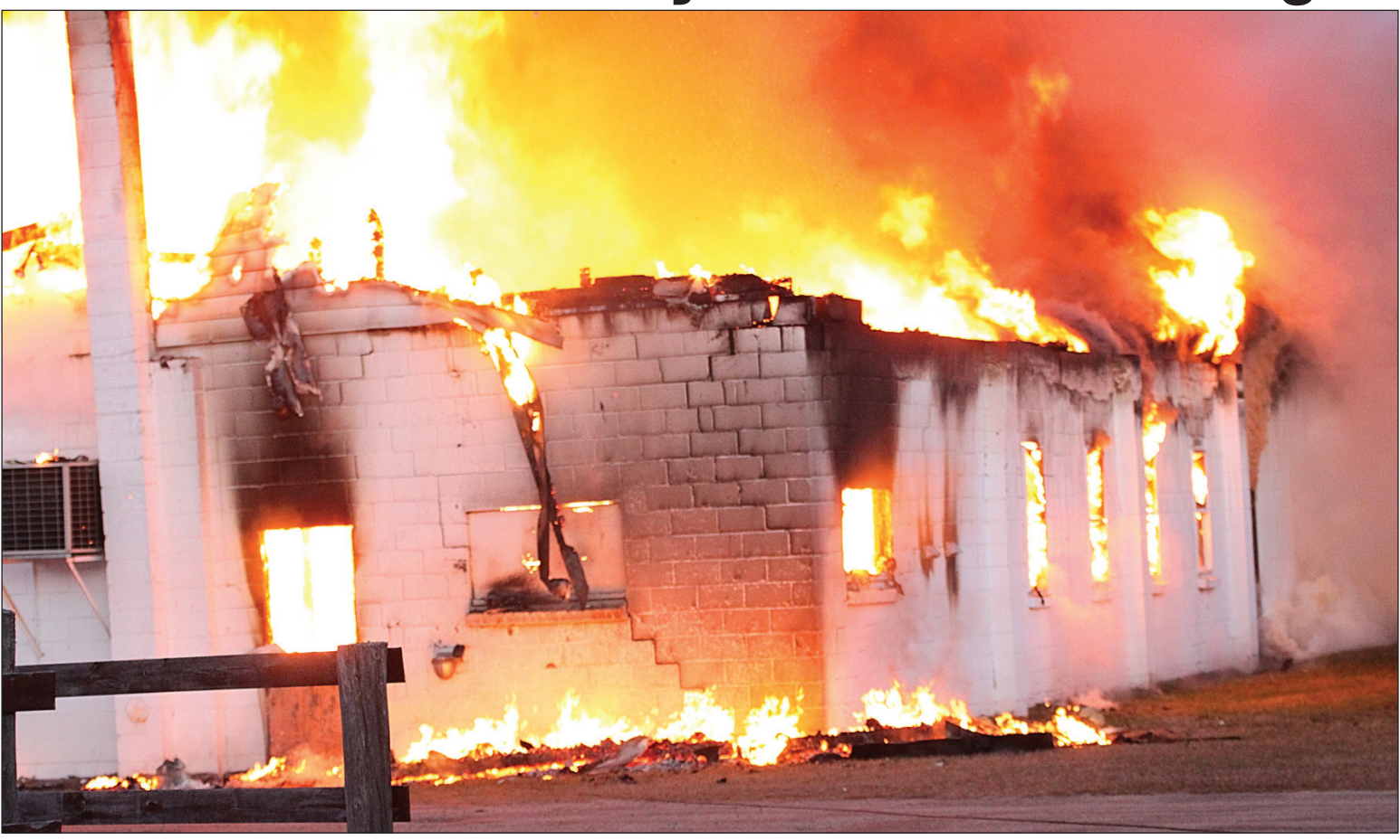
The Harcourt Community Centre was destroyed in a fire on Sunday, Nov. 28.