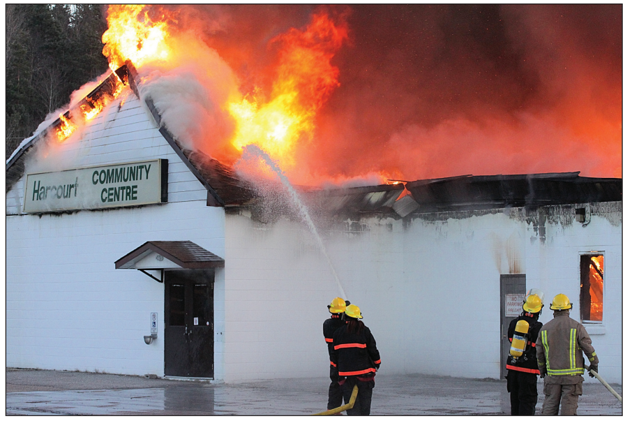
Above, Highlands East firefighters control the blaze at the Harcourt Community Centre on Sunday, Nov. 28. Photo by Tammy Donaldson Right, not much remained of the beloved building the day after the fire. ANGELICA INGRAM Staff