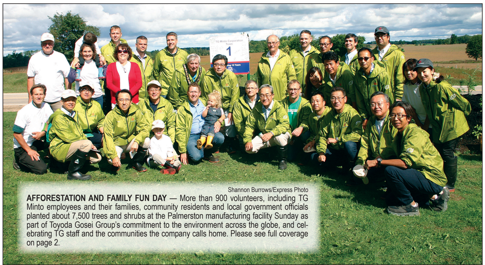
AFFORESTATION AND FAMILY FUN DAY — More than 900 volunteers, including TG Minto employees and their families, community residents and local government officials planted about 7,500 trees and shrubs at the Palmerston manufacturing facility Sunday as part of Toyoda Gosei Group's commitment to the environment across the globe, and celebrating TG staff and the communities the company calls home. Please see full coverage on page 2.