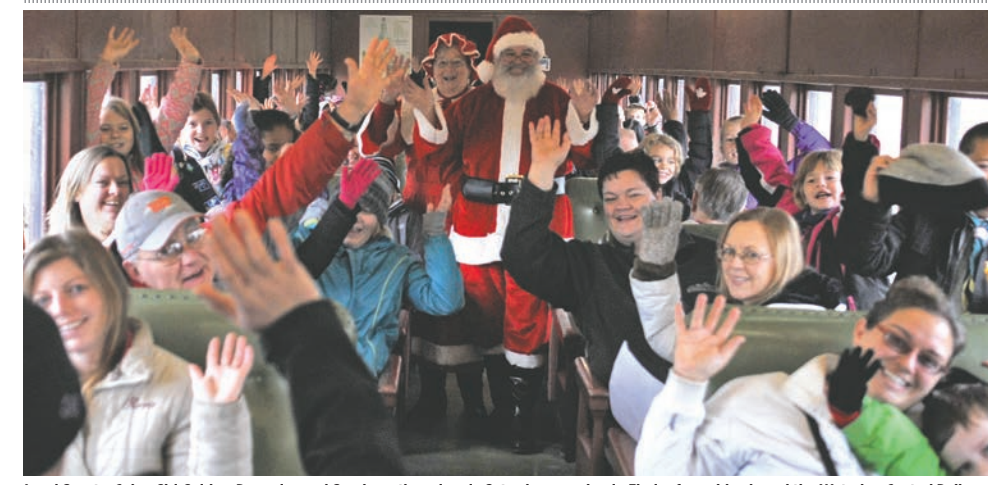
Local Scouts, Cubs, Girl Guides, Brownies and Sparks gathered early Saturday morning in Elmira for a ride aboard the Waterloo Central Railway with Mr. and Mrs. Claus. Nearly 200 people boarded the train and sang carols and ate goodies along the way.