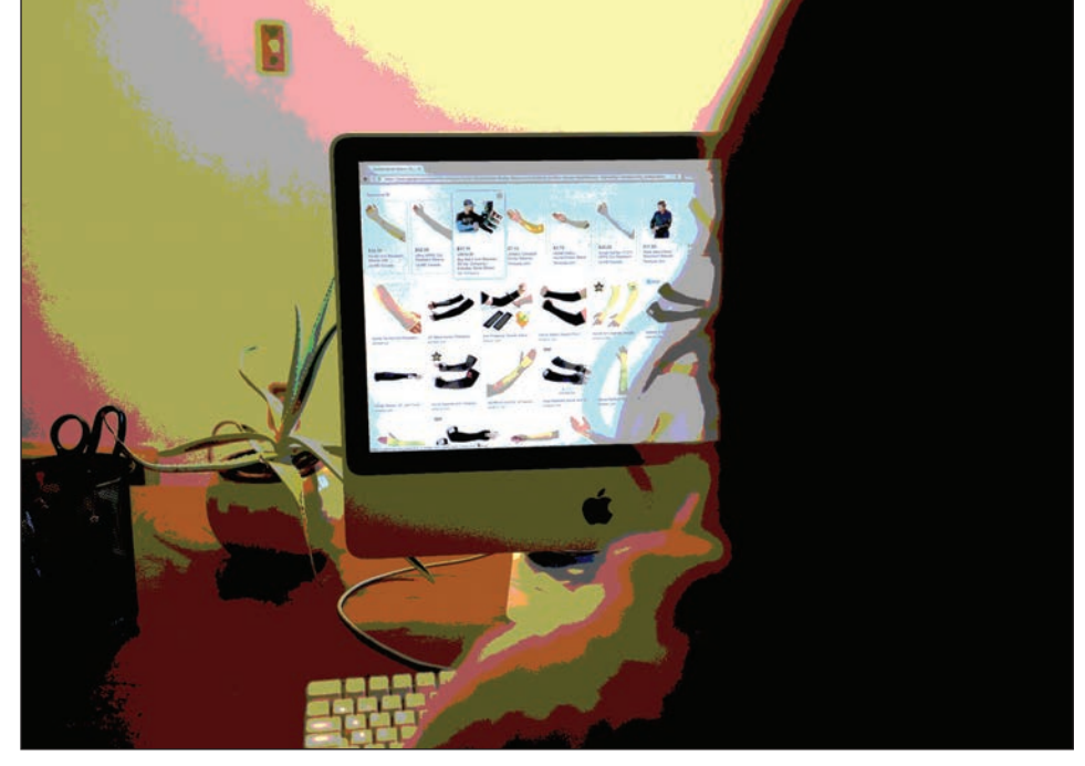
Some educators across the province, including a few working at Trillium Lakelands District School Board, wear "bite sleeves" - protective coverings to avoid injury while working with children, according to the ETFO local president. A survey of more than 1,600 educators across the province found that more than half had been subjected to violence in the previous year, mostly from students. The teachers' union says more educational assistants and mental health specialists are needed in the classrooms to properly support children.

The teacher said that in her experience, EAs handle more of the behavioural issues.