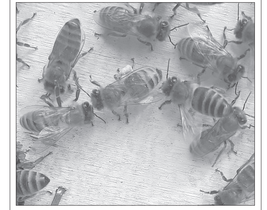
Bees in the district had a rough winter, with reports of

Social distancing was in full practice for buyers during Saturday's cattle sale in Stratton. More than 1400 animals were auctioned off throughout the day. Another sale is scheduled to take place in fall.