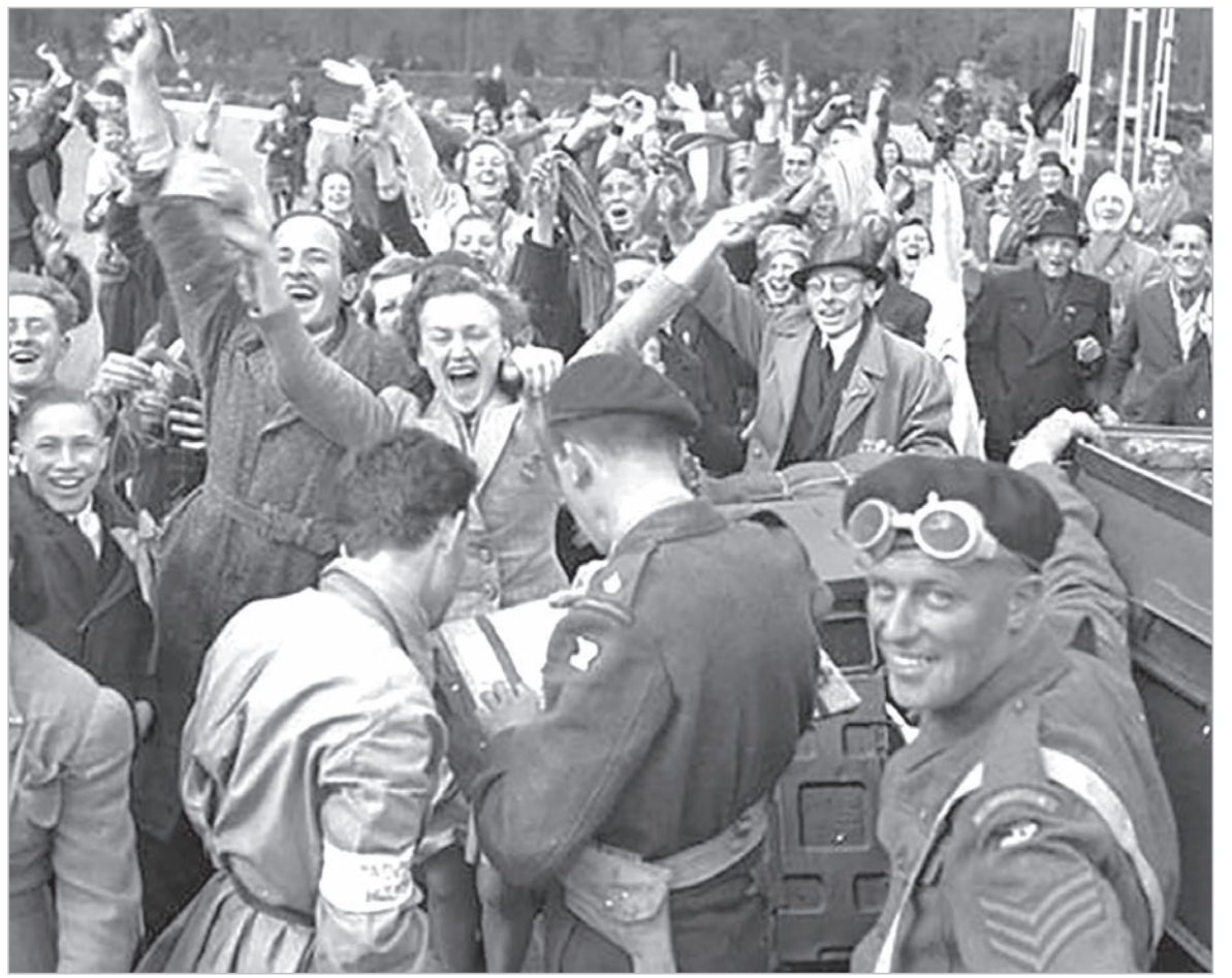
Dutch civilians and Canadian Army troops celebrate the Liberation on May 7, 1945 in Utrecht, Netherlands.