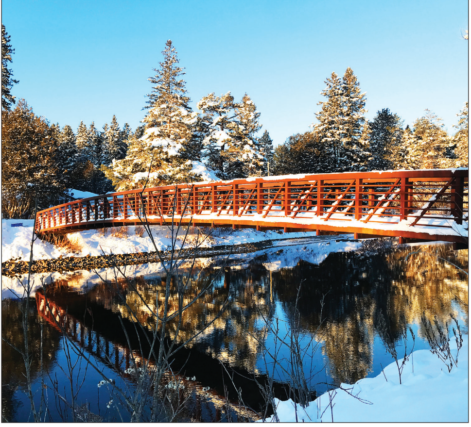
The Loggers' Crossing is reflected in the Gull River close to dusk in Minden.

He can also consider this column my vote on the matter.