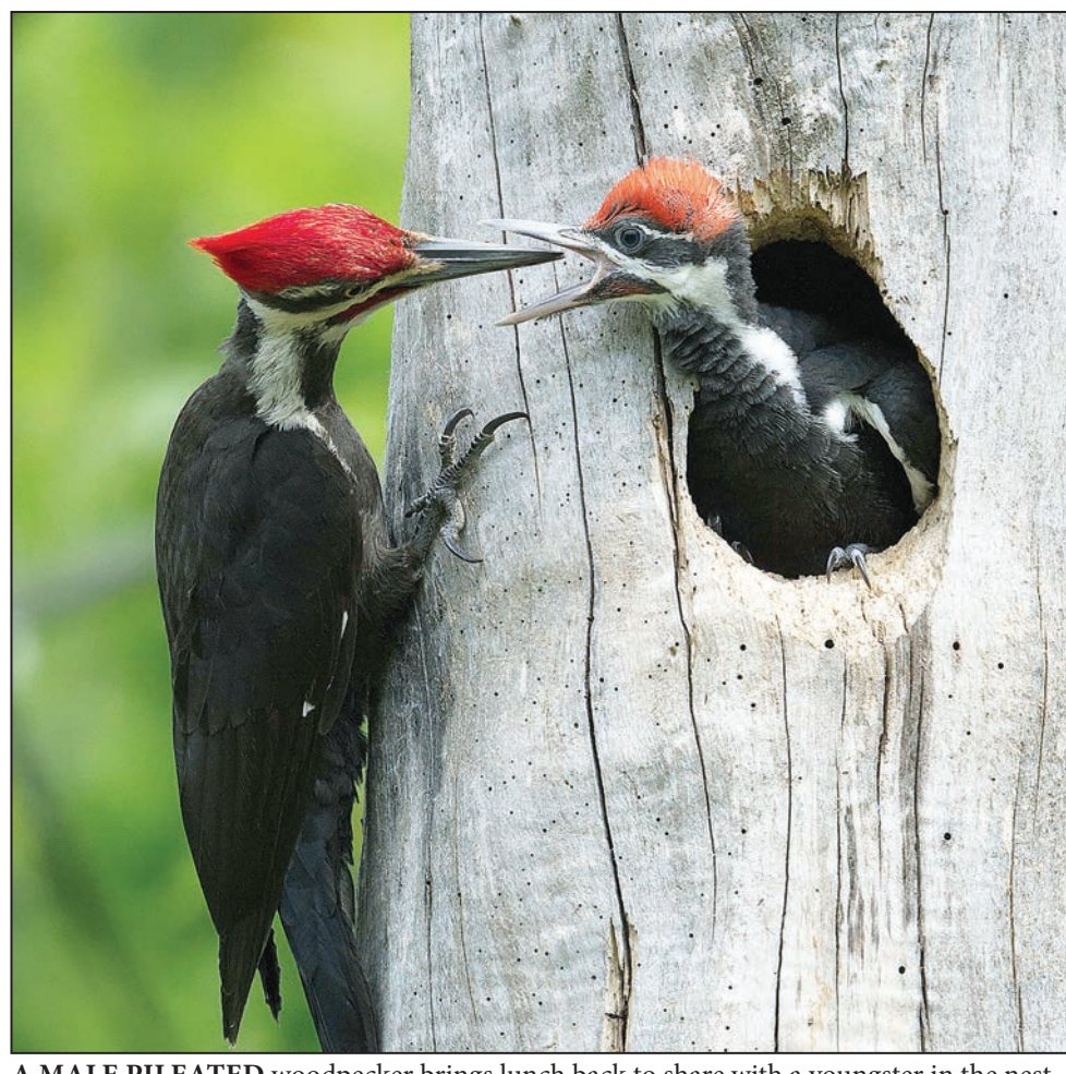
A MALE PILEATED woodpecker brings lunch back to share with a youngster in the nest. Ronny D'Haene

"You just have to be tenacious," he says. "It's like what they say about the lottery, if you don't play you can't win."