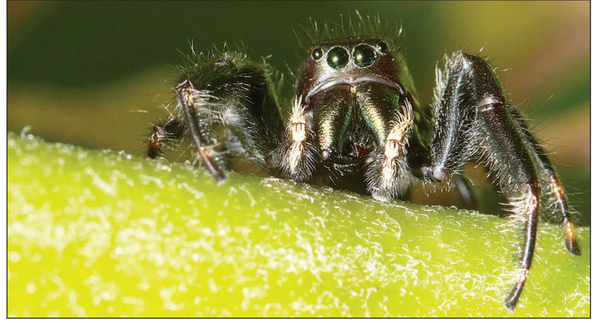
BOTTOM LEFT: A RED-TAILED hawk brings food back to a nest made of sticks high in a tree. The feathers of red-tailed hawks, like those of eagles, are considered sacred to many Indigenous people of North America. BOTTOM RIGHT: A TINY black jumping spider stares down a camera lens positioned just inches away. Jumping spiders are active hunters that chase down their prey. Many have eight eyes: two large eyes in front to get a clear image and judge distance, and extra side eyes to detect when something is moving.