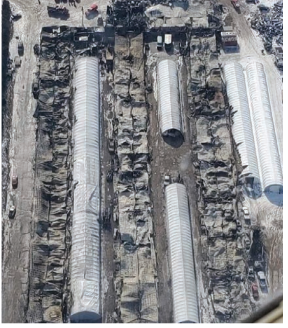
A photo from a GoFundMe for fire victims shows an aerial view of the destruction.