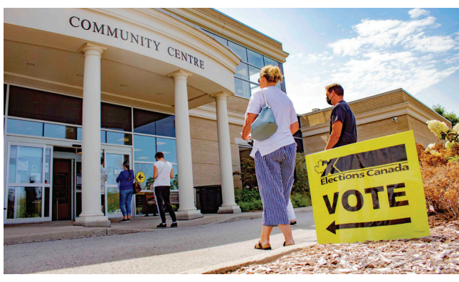
Voters wait at the NOTL Community Centre on Monday to cast their ballots ahead of election day. EVAN SAUNDERS