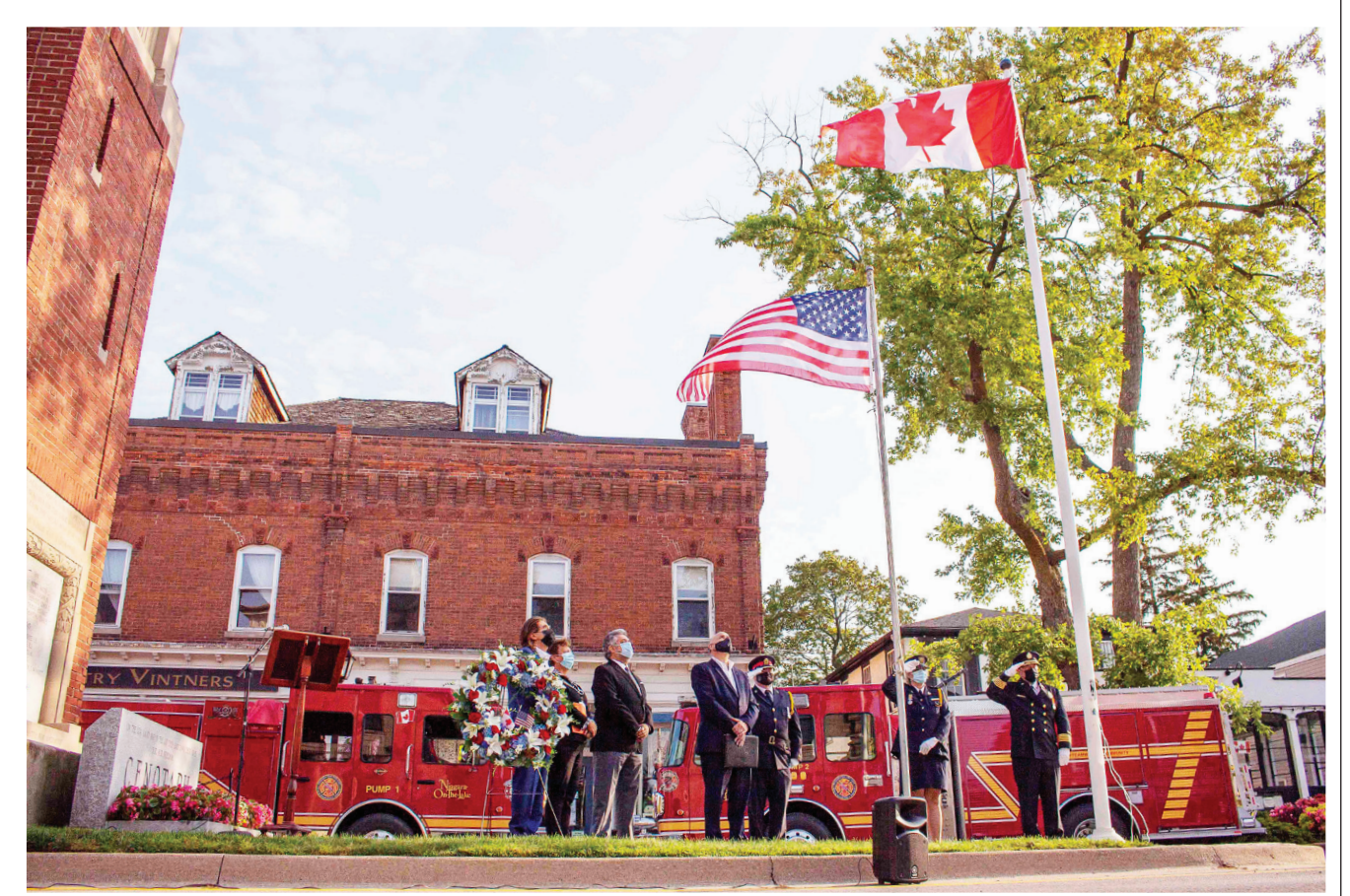
NOTL politicians stand in solidarity Saturday while firefighters salute the Canadian and U.S. flags after they were raised from half mast during a memorial ceremony on the 20th anniversary of the terror attacks of 9/11.