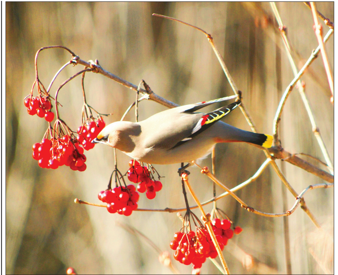
A cedar waxwing plucks berries from a highbush cranberry shrub.