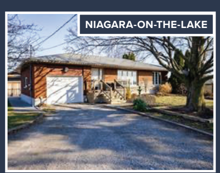
1090 Niagara Stone Road 2+2 Bedroom • 1 Bath • $1,059,900