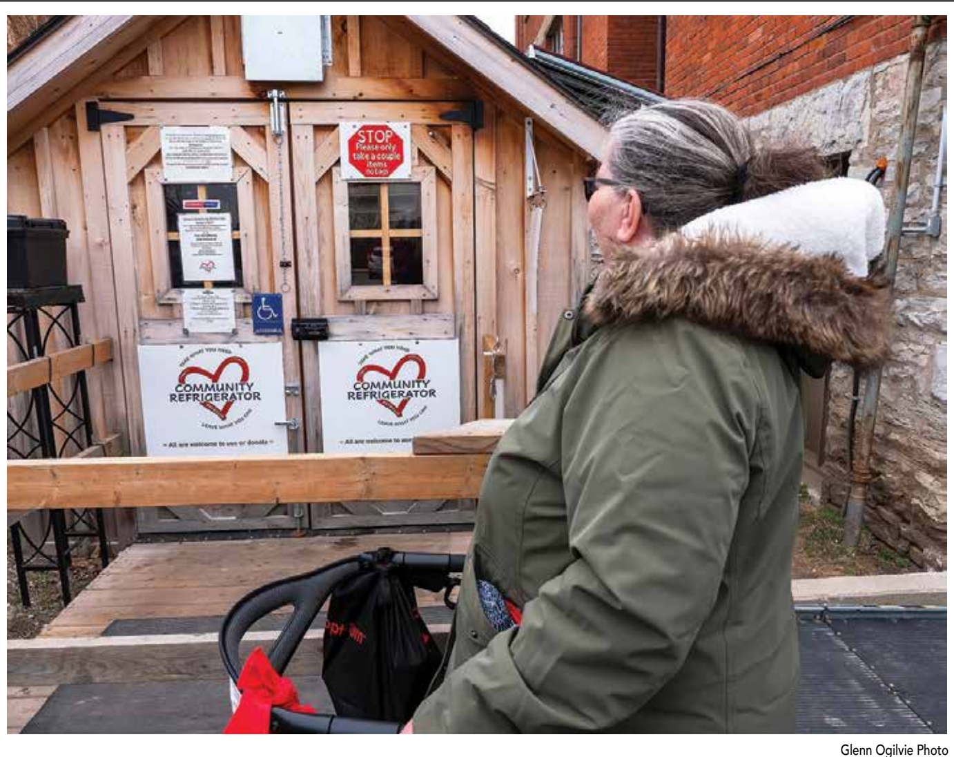
People of all ages use Petrolia's Community Refrigerator to meet their food needs once the bills are paid