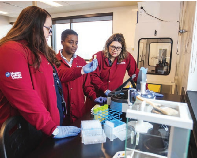
The funding will support work on wet chemistry and spectroscopy to ensure the quality of various food and beverage products in the food chemistry lab. SUPPLIED