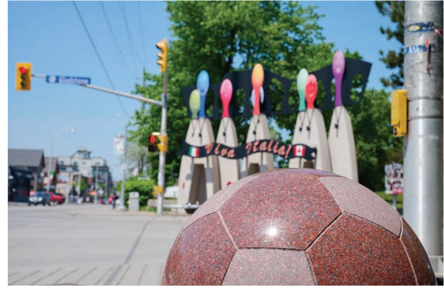
While Preston Street is losing much of its Italian-owned businesses, the BIA said its culture is being celebrated in different ways.