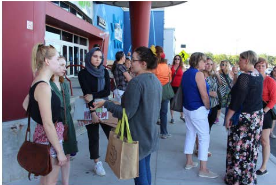
A group of protesters led by pro-choice London stood outside London's Silvercity Cineplex movie theatre on the evening of Unplanned 's Canadian opening.