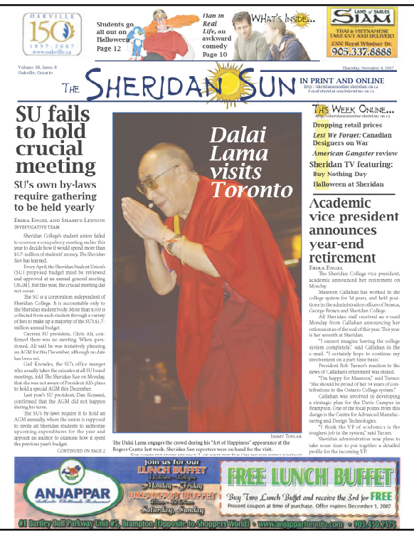
All students in Journalism-Print contribute to The Sheridan Sun, a community newspaper that serves the college's 15,000 students and staff.

the OCNA, the Hamilton Spectator, Toronto Star, Toronto Sun and the Canadian Press, helps us define the curriculum around the needs of