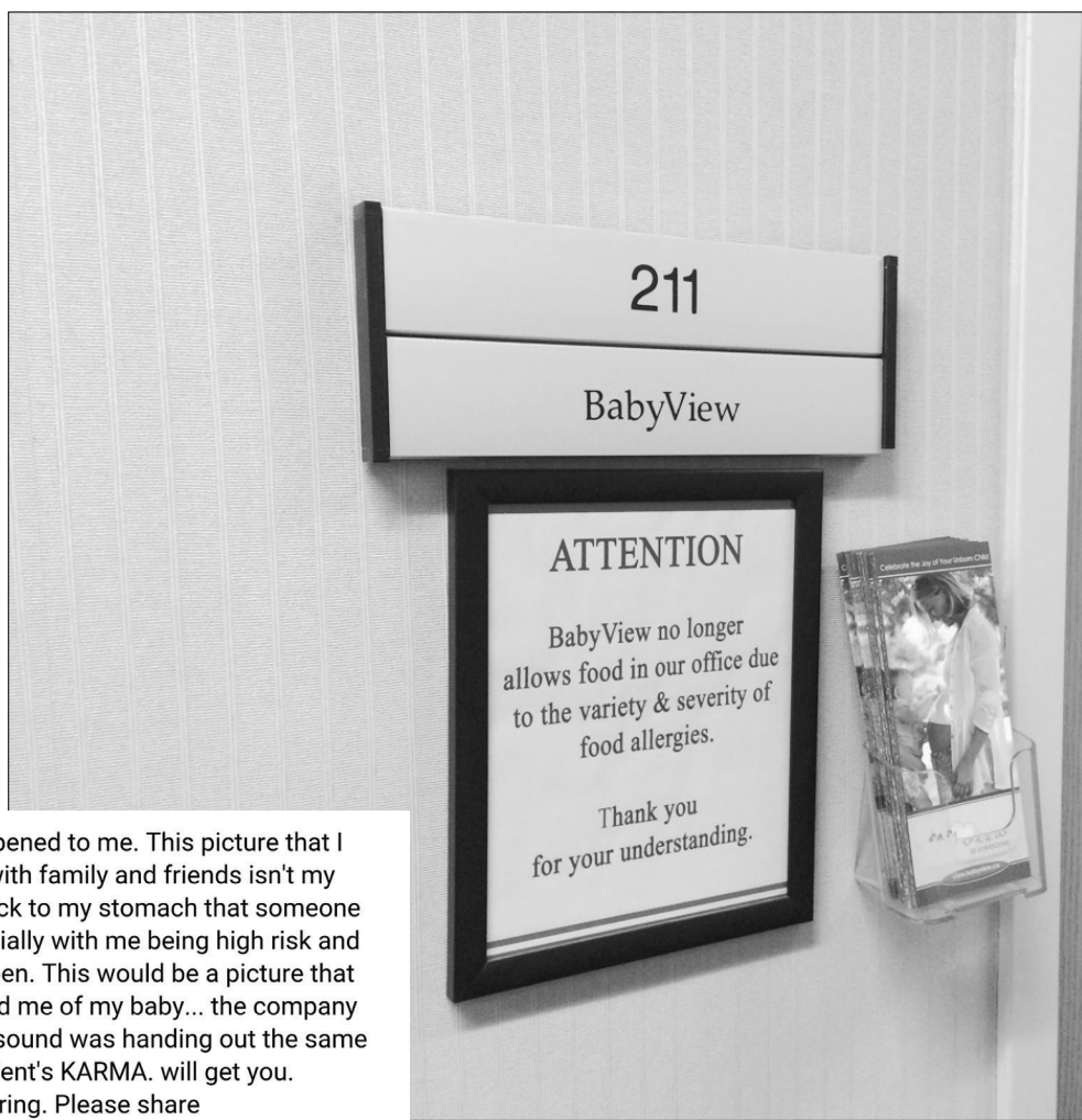
DURHAM -- The office of BabyView was closed Wednesday. Numerous women have complained that the 3D images of their babies-to-be are not images of their babies at all but rather the same image. This glitch was discovered on a Facebook mothers group, left.

So yes this just happened to me. This picture that I have been sharing with family and friends isn't my daughter. I am so sick to my stomach that someone could do this. Especially with me being high risk and anything could happen. This would be a picture that would always remind me of my baby... the company that did the 3d ultrasound was handing out the same pictures to all her client's KARMA. will get you. BABYVIEW 3d pickering. Please share