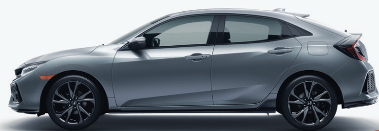
2017 HONDA CIVIC HATCHBACK TURBO