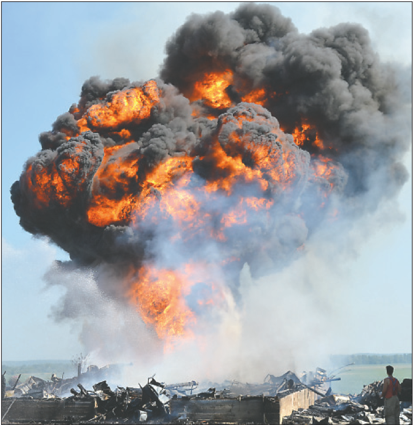
Fire destroyed a barn on Stone Road near Douglas early Monday morning. The structure, owned by Jim Lynch, was levelled within minutes and had more than 30 firefighters from three townships on site battling the blaze. Not only did the fire cause severe heat that melted parts of other buildings, but it was a challenge for firefighters with temperatures hovering above 40 degrees with the humidity factored in.

Members of the Douglas department remained on scene for most of the day putting out the hotspots while they waited for heavy machinery to arrive and remove some of the debris.