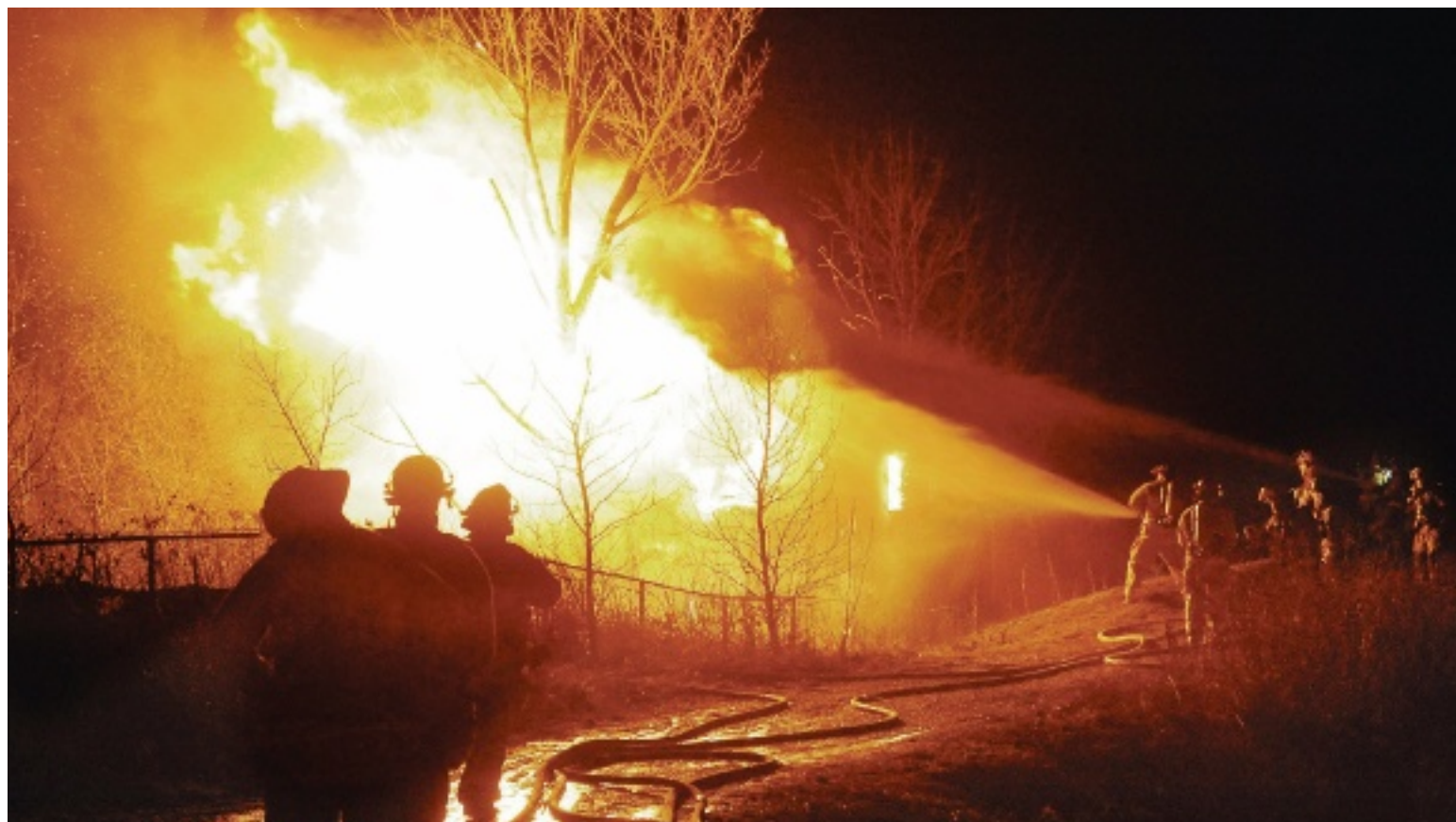
Oakville firefighters work at the scene of a blaze at a vacant barn on Sixth Line last Saturday. Fire officials believe the cause of the fire may be arson. The investigation is continuing.